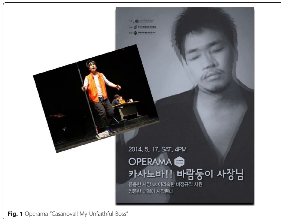
Fig. 1 Operama “Casanova!! My Unfaithful Boss”

metaphor, the characters of this performance are the CEO and temporary employees of a company. Especially, Leporello, the servant from Don Giovanni, has transformed into a custodian and provides the overall commentary of the performance.